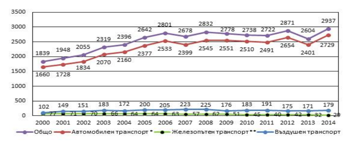
Fig. 1 Final energy consumption in toto* and by transport type** over the period 2000 – 2014 (thousand tonnes of oil equivalent)

[Key: Общо = Total; Автомобилен транспорт = Road transport; Железопътен транспорт = Rail transport; Въздушен транспорт = Air transport]